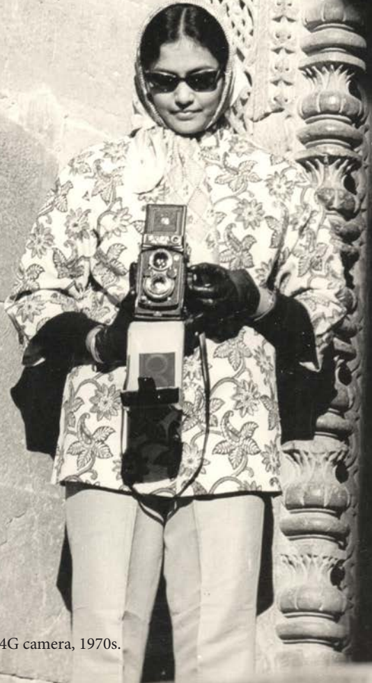
A tourist with a Yashica Mat 124G camera, 1970s.